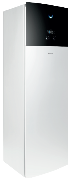
Image of 180 litre and 230 litre version

The MMI was especially designed to be very intuitive. The high contrasted colour screen delivers stunning and practical visuals that really help you as installer or service engineer.